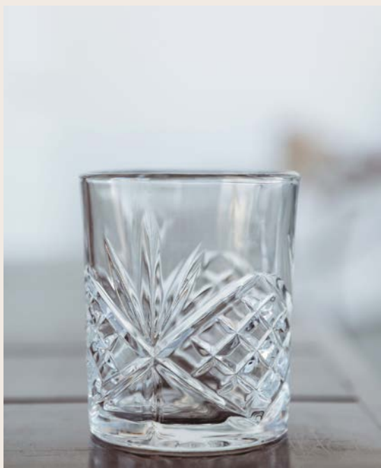
CRYSTAL CUT FLORENCE TUMBLER