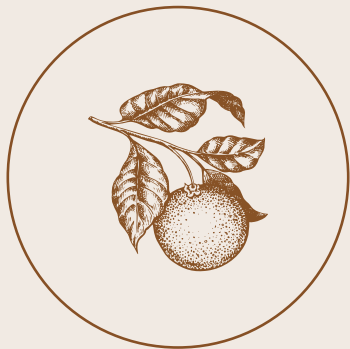
TABLE DECOR PACKAGE arredamento

Enhance your table setting with our tableware packages. Packages only in conjunction with Sorella Catering Packages.