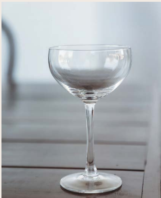
CHAMPAGNE COUPLE GLASSES