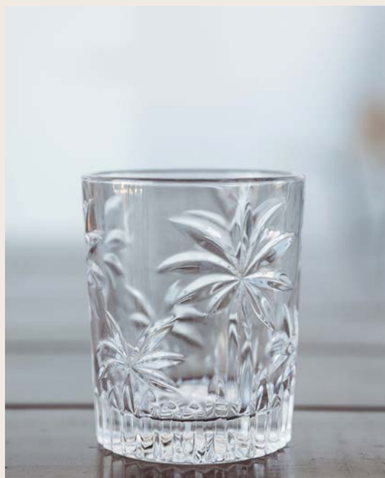
PALM TREE MALIBU TUMBLER