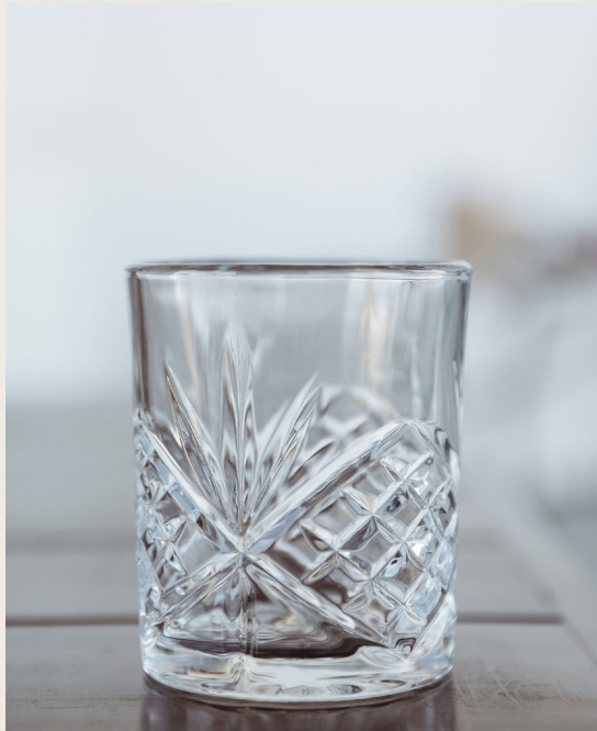
CRYSTAL CUT FLORENCE TUMBLER