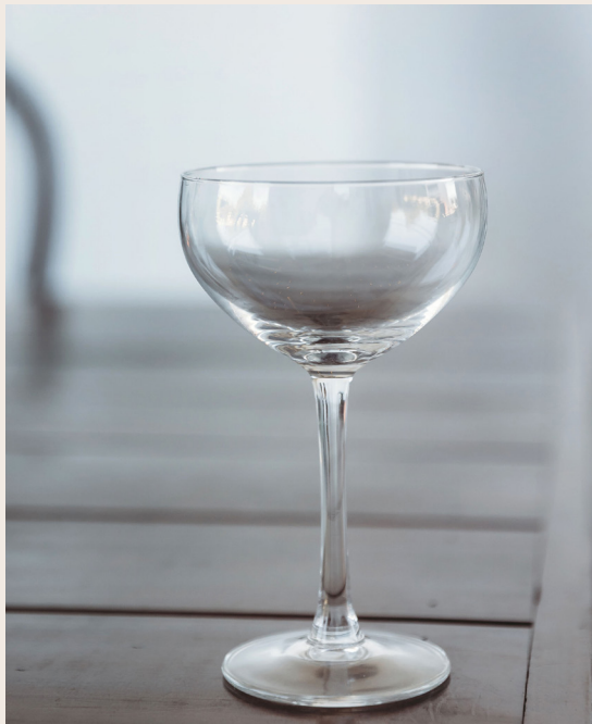
CHAMPAGNE COUPE GLASSES