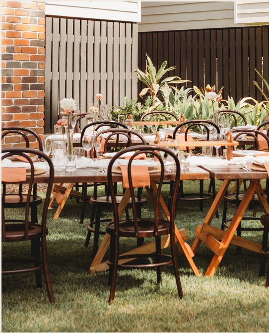
DARK WALNUT BENTWOOD CHAIR