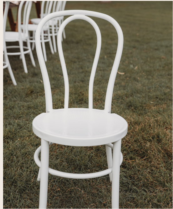
WHITE BENTWOOD CHAIR