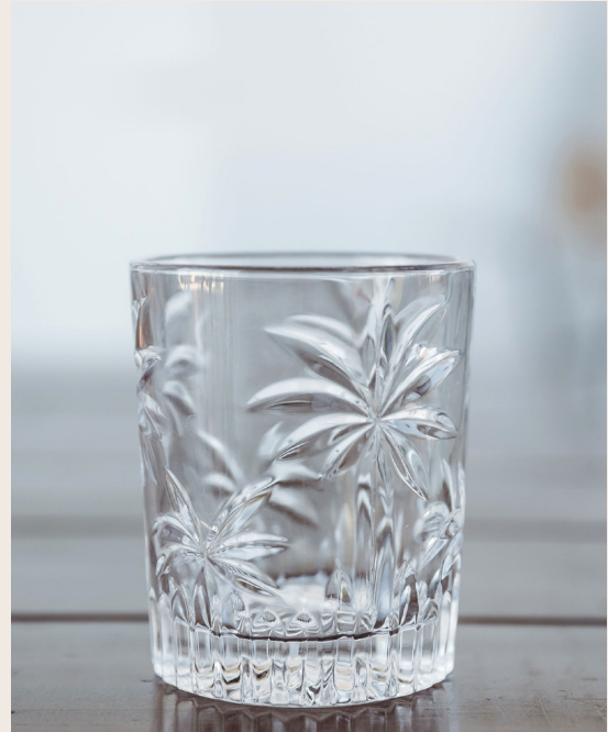
PALM TREE MALIBU TUMBLER