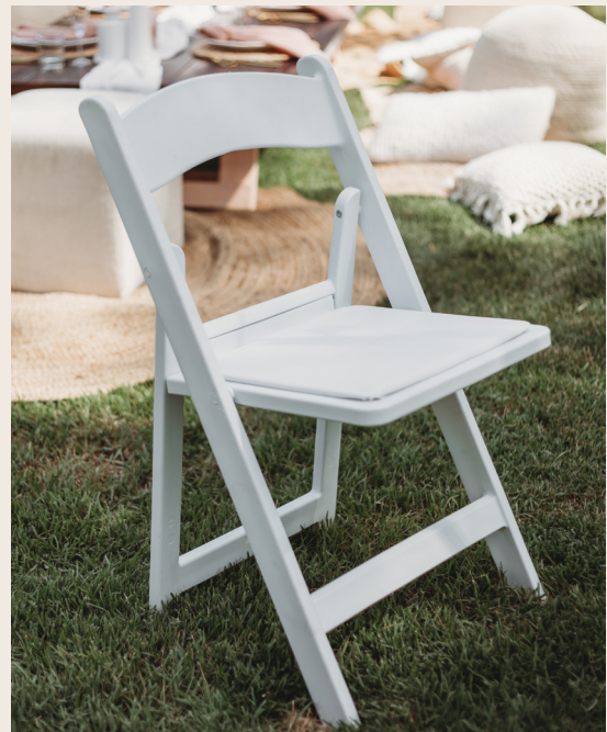
WHITE AMERICANA CHAIRS