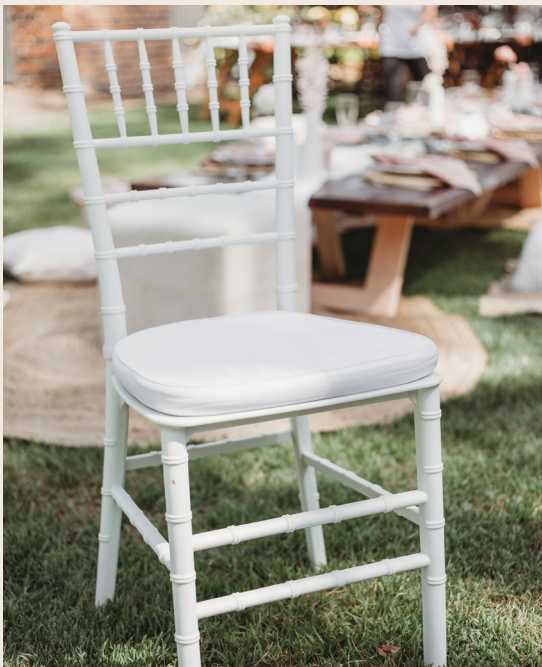
WHITE TIFFANY CHAIRS